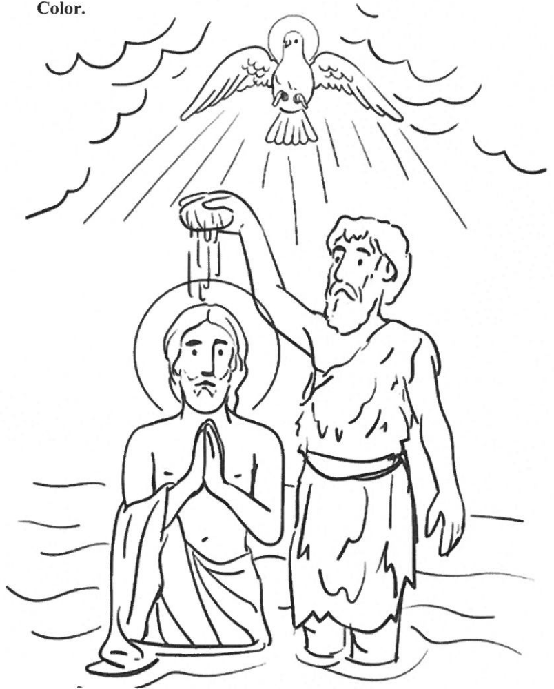
Baptism of the Lord