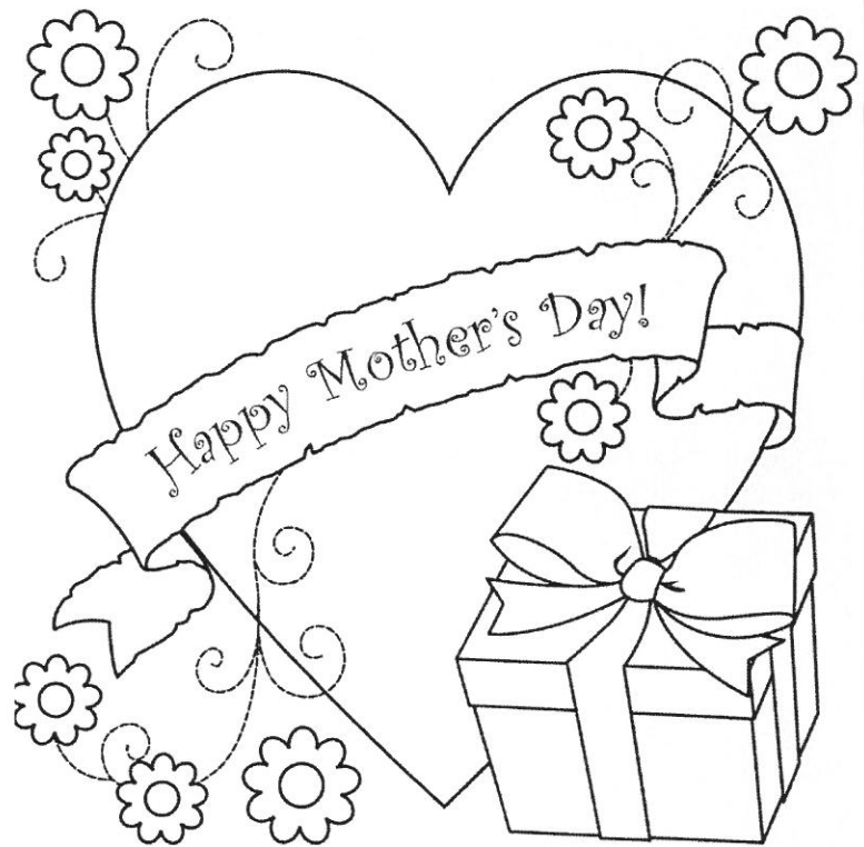
A Mother's Love - Author Unknown

There are times when only a mother's love Can understand our tears, Can soothe our disappoints And calm all of our fears. There are times when only a mother's love Can share the joy we feel When something we've dreamed about Quite suddenly is real. There are times when only a mother's faith Can help us on life's way And inspire in us the confidence We need from day to day. For a mother's heart and a mother's faith And a mother's steadfast love Were fashioned by the angels And sent from God above.